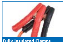
Fully Insulated Clamps Protects user from current transfer through clamps