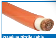
Premium Nitrile Cable Double insulated heavy-duty cable offering unparalleled conductivity and insulation